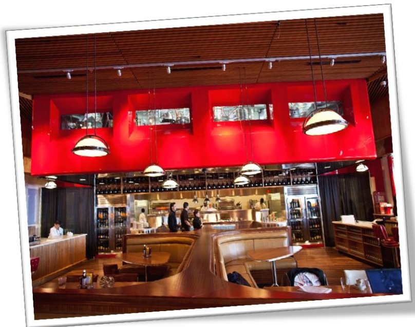
Pinch Restaurant at Empire City

This past summer, Empire City Casino announced completion of its latest project, a